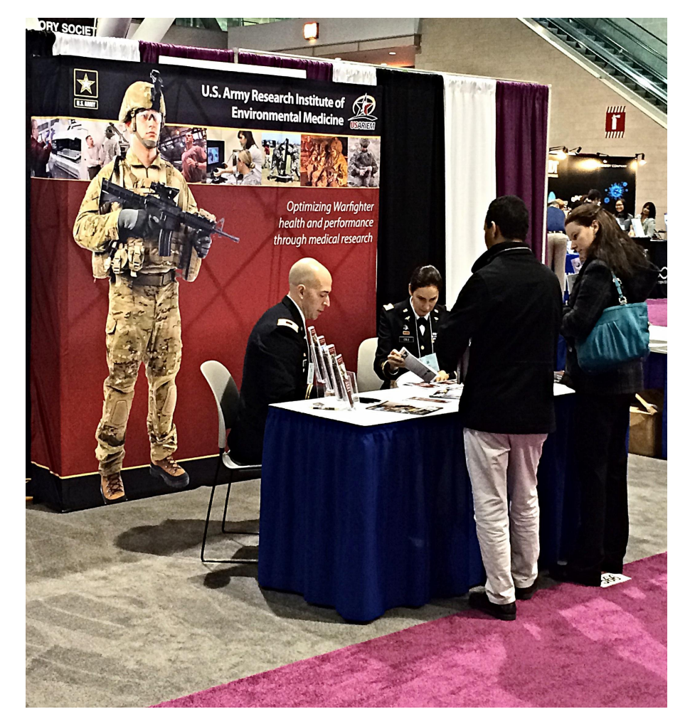
ASBMB 2015 Annual Meeting, Boston 2015

BUT many scientists work for other military and security federal agencies, defense contractors, or have military funding in academic laboratories.