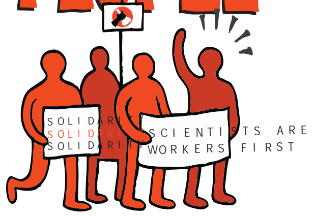
Illustrations by Matteo Farinella